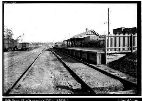
Orbost Railway Station

to justify the cost of a bridge, and the railway never crossed the river to the township.