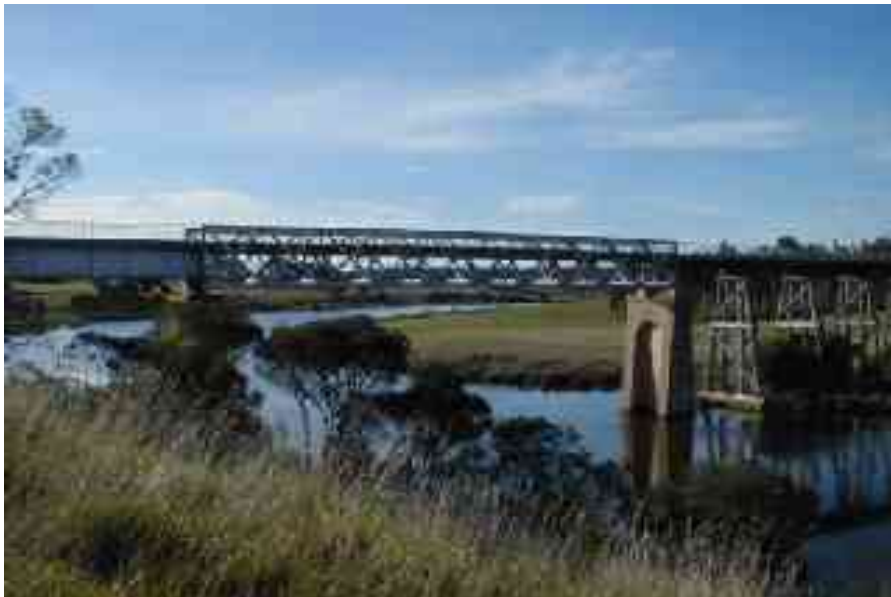
Rail Trail Bridge at Nicholson