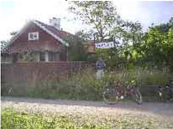
John Old railway station of Labyvad