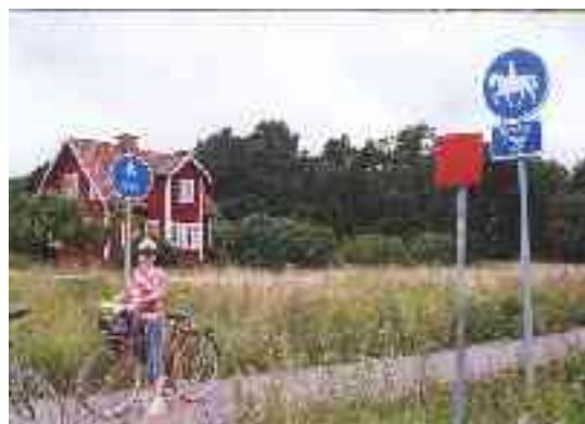
Barbara, *Note no helmet (not by choice) Sign translates, Ride right side (horses)